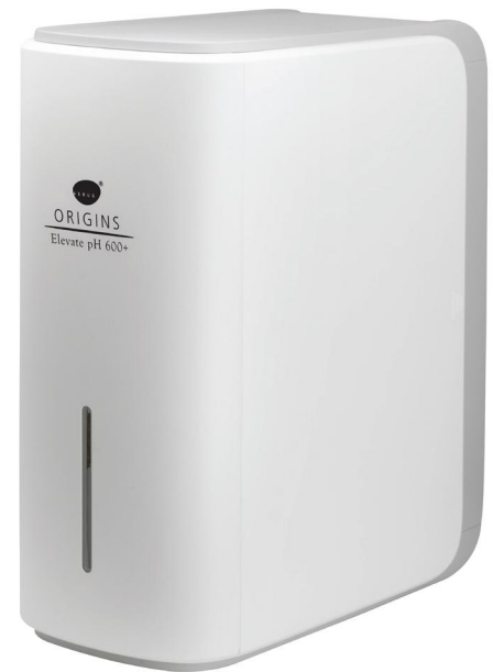
Includes dedicated 3.2 gallon tank and all hardware. Faucet sold separately.

Superior filtration and design puts clear, fresh, great tasting water right at your fingertips. No more guessing what's in your water. Reverse Osmosis works to remove dissolved substances from your water. RO is capable of rejecting: salts, sugars, proteins, dyes, particles, heavy metals, dissolved organics, and disinfectant byproducts. The water is then enhanced by our pH our "Elevate pH filter" leaving your water perfectly balanced for enhanced hydration.